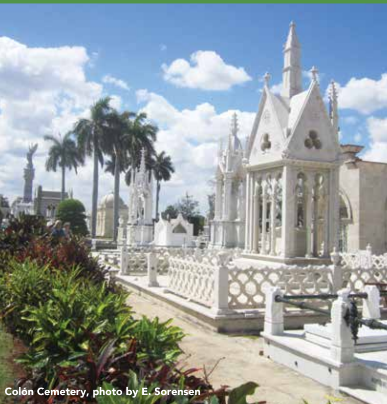
Colón Cemetery

An optional two-night prelude is offered in Cienfuegos from January 23-25, 2018.