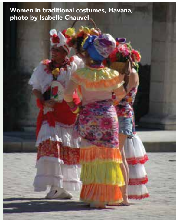
Women in traditional costumes, Havana

CONCLUDE with two days in Havana, meeting up-and-coming artists and performers at specially arranged events