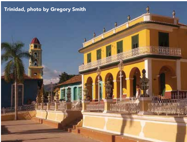
Trinidad