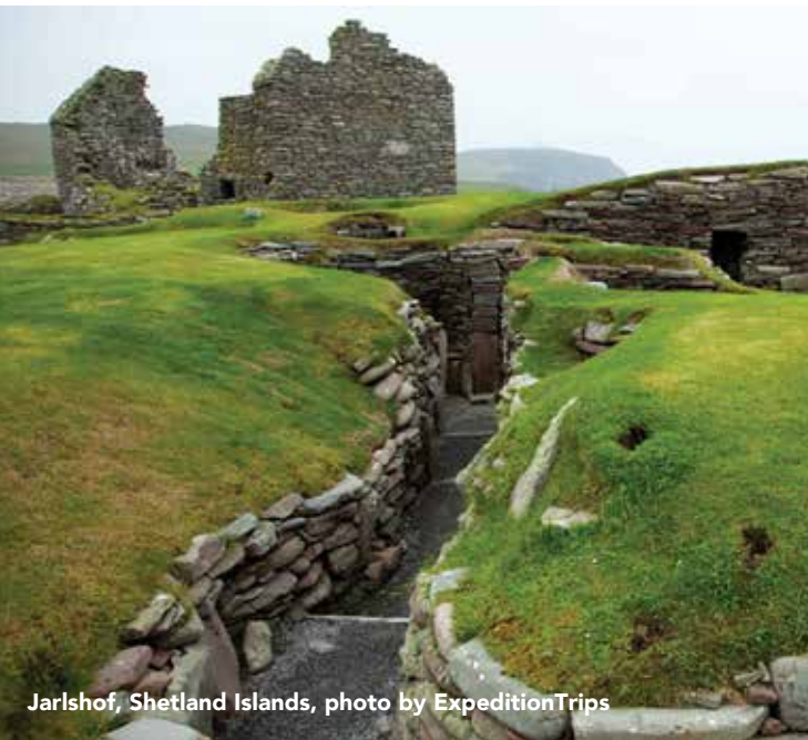
Jarlshof, Shetland Islands