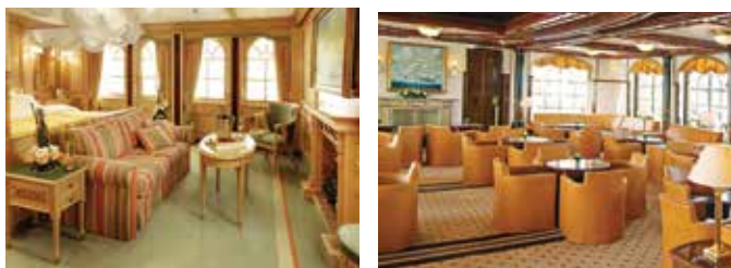
Sea Cloud II Owner's Suite (left) and lounge (right)

The sailing yacht Sea Cloud II is a three-masted barque steeped in the elegance of yesteryear and complemented with the most modern amenities. Sister ship of the legendary Sea Cloud , Sea Cloud II has 47 outside cabins and travels under 23 billowing sails trimmed by hand. From her mahogany-paneled library and gracious lounge to the fitness area and water sports platform, no detail has been overlooked. Praised by the world's most discerning travelers, Sea Cloud II receives consistent high rankings from Condé Nast Traveler . She celebrated her 15th anniversary in 2016. ■