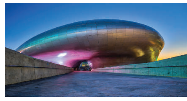
Dongdaemun Design Plaza, South Korea