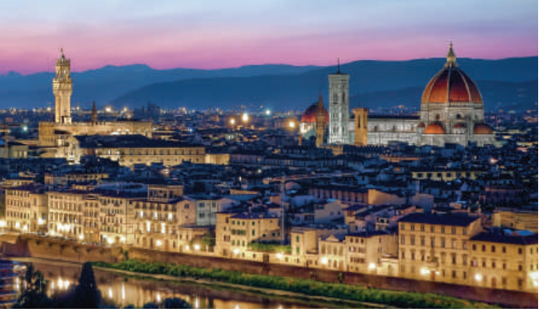
Florence, Italy, photo by Mustang Joe