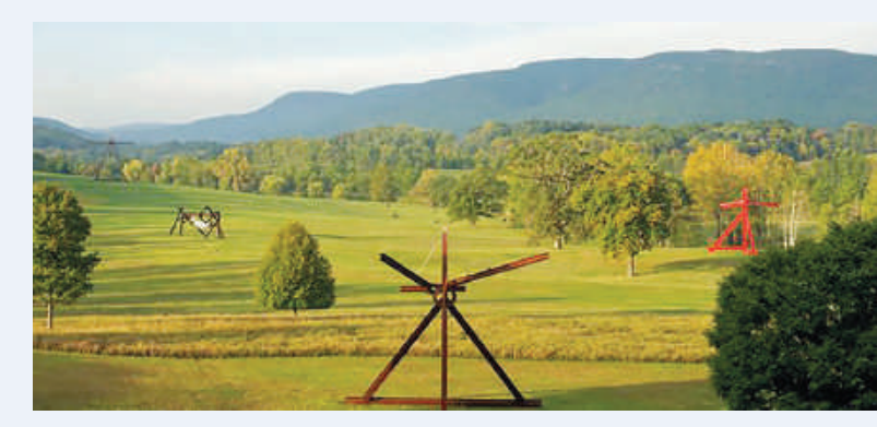
Storm King Art Center, New York

Circumnavigate Sicily, stepping stone between Europe and Africa, on a classic voyage aboard Sea Cloud II . Roam ancient Agrigento, and marvel at the Valley of the Temples. Optional Palermo prelude. Cruise rate from $8,999