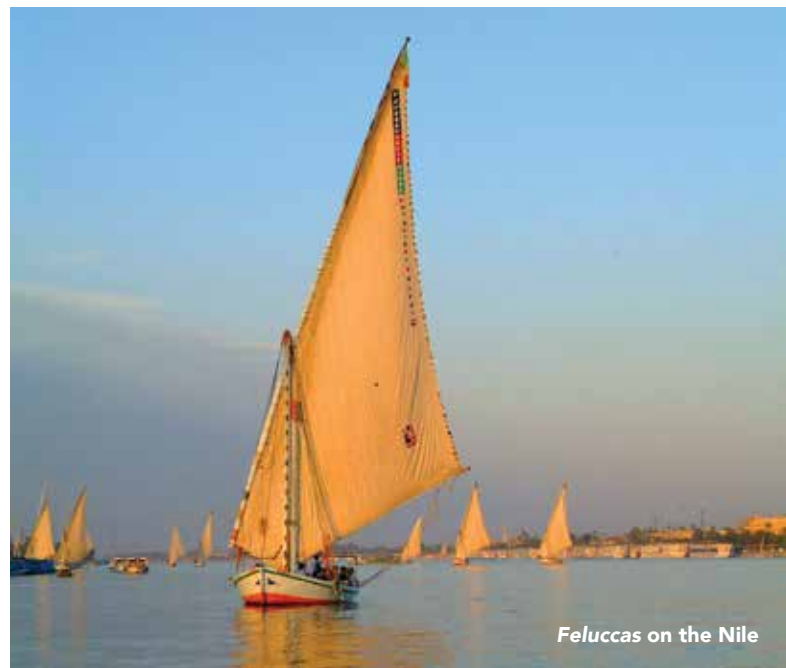
Feluccas on the Nile

As we cruise attend a morning lecture, followed by lunch. Arrive in Aswan in the early afternoon and visit the exquisite Philae Temple, relocated due to the rising flood waters of the Nile. We will also enjoy a sail on a Nile felucca (traditional sailboat). This evening the captain hosts our farewell dinner. B,L,D