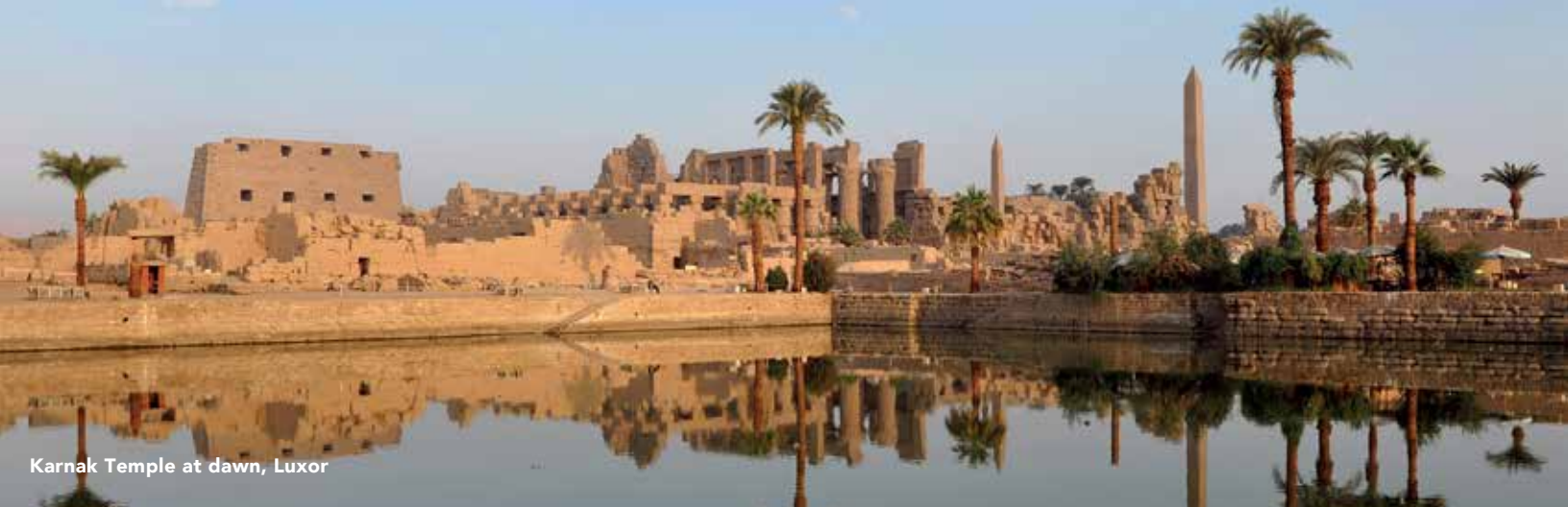
Karnak Temple at dawn, Luxor