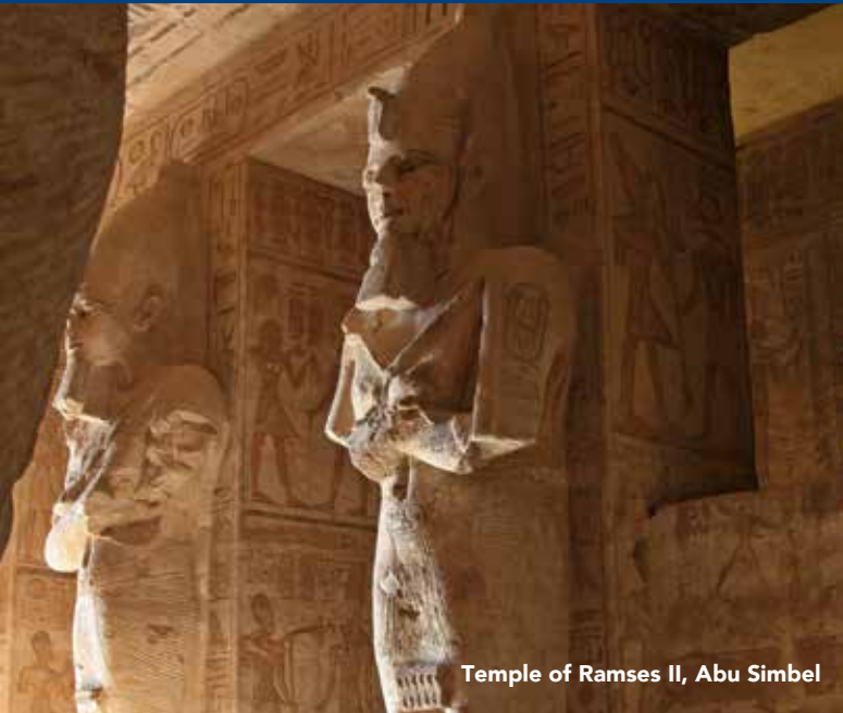
Temple of Ramses II, Abu Simbel