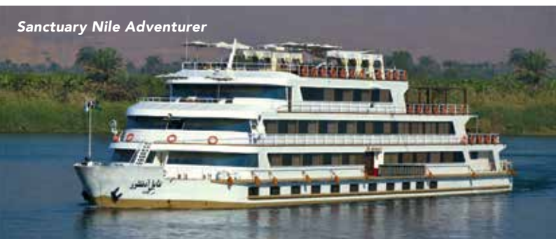
Sanctuary Nile Adventurer

NOT INCLUDED IN RATES International airfare; passport and visa fees; alcoholic beverages other than wine/beer at dinners; personal items and expenses; airport transfers for those not on suggested group flights; baggage in excess of one suitcase; optional Cairo postlude; trip insurance; any other items not specifically mentioned as included.