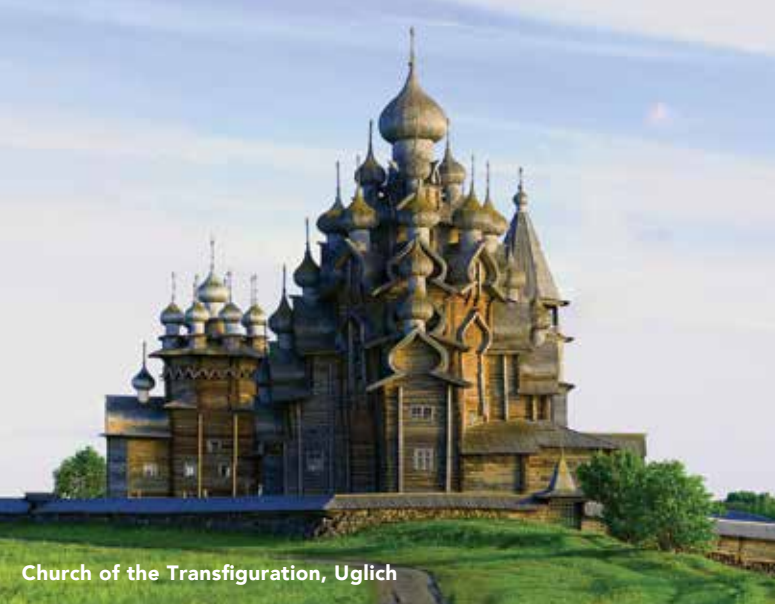
Church of the Transfiguration, Uglich

An optional three-night prelude in Moscow is offered from May 30 to June 3.