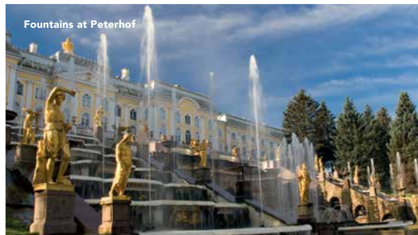
Fountains at Peterhof

Stay three nights in this imperial capital, moored on the Neva River aboard Volga Dream . View the Hermitage’s unparalleled French Impressionist collection, then travel by hydrofoil to Peterhof. Peter the Great’s magnificent complex of palaces and gardens has been renovated to its former Baroque splendor after near-destruction during World War II. Try to outwit the “trick” fountains Peter installed in the lower gardens, and enter Monplaisir Palace to see where Catherine the Great took her baths. B, L, D