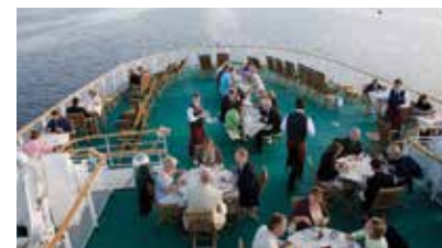
Owner's Suite (left) and Sun Deck (right)

M .S. Volga Dream is known for her elegant appointments, meticulous design, and impeccable service. All 56 staterooms have river views, marble-accented bathrooms, air conditioning, telephones, flat-screen satellite TVs, and a safe. Meals showcase Continental cuisine alongside Russian specialties. The full-length sun deck is a lovely setting for al fresco dining. The lounge offers panoramic views and live music. Other amenities include a fitness room, massage room, and sauna. A physician accompanies each cruise.