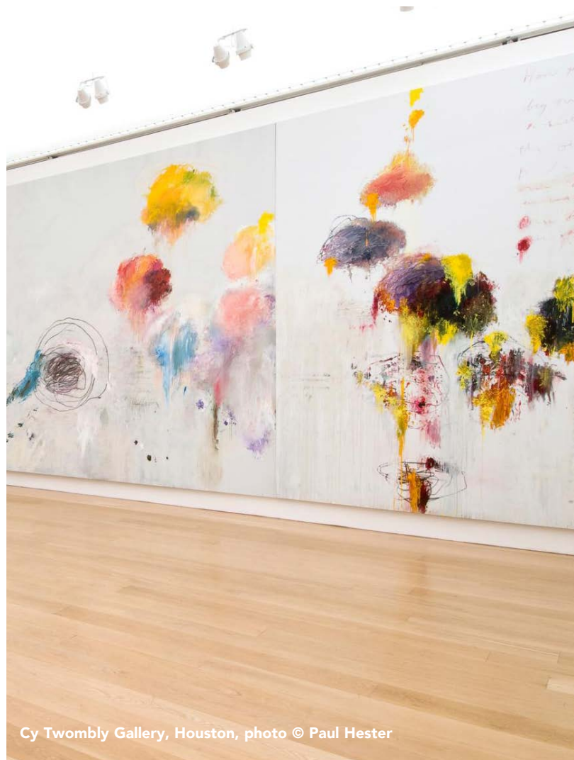
Cy Twombly Gallery, Houston

Enjoy breakfast at the hotel at your leisure and transfer to the Houston airport for your return flight. B