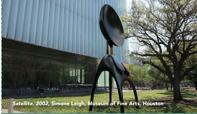
Satellite, 2002, Simone Leigh, Museum of Fine Arts, Houston

NOT INCLUDED IN RATE: Airfare; meals not specified; alcoholic beverages other than what is noted in inclusions; personal items and expenses; airport transfers; excess baggage; trip insurance; any other items not specifically mentioned as included.