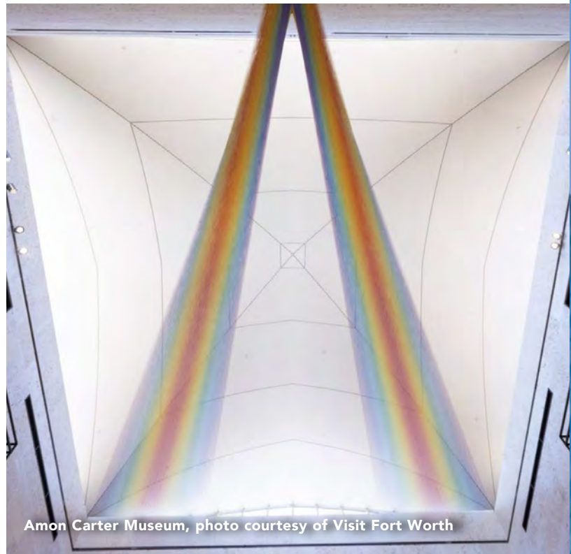
Amon Carter Museum