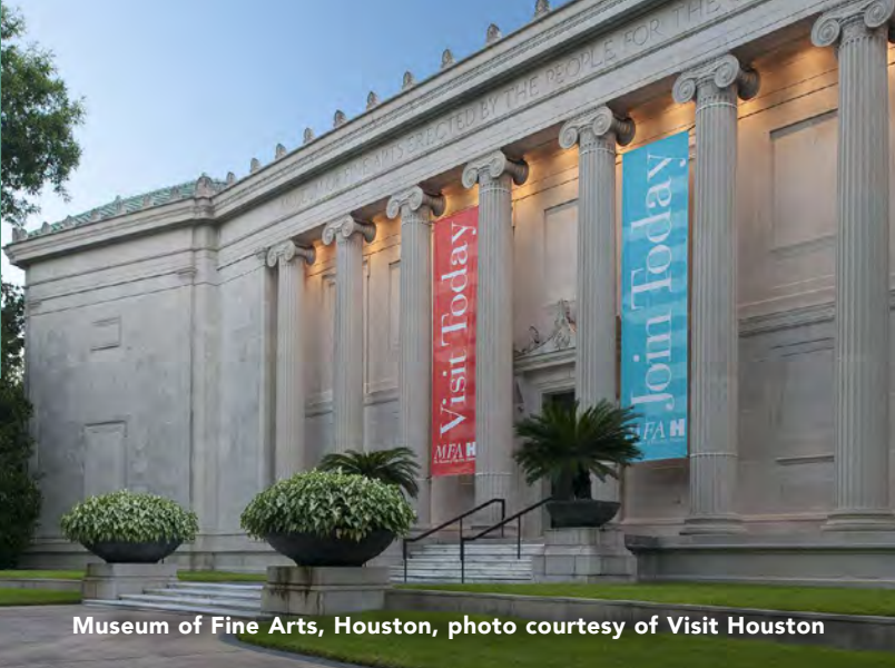
Museum of Fine Arts, Houston