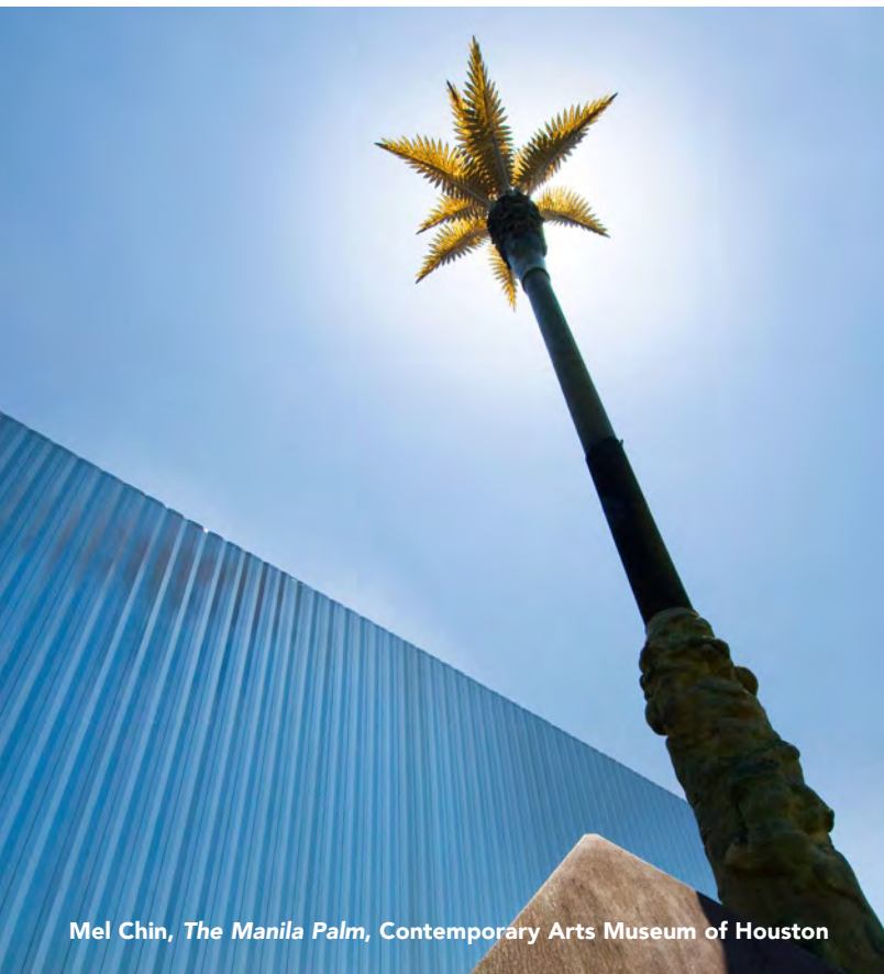
Mel Chin, The Manila Palm , Contemporary Arts Museum of Houston

Witness regional, national, and international artwork from the last 40 years and ponder its impact on modern-day life during a curator-led tour of the Contemporary Arts Museum of Houston . For 75 years, the museum has led the way in groundbreaking diverse presentations, such as Dále Gas —the first-ever exhibition of Chicano art. Take part in an in-depth discussion with Jennifer Dasal.