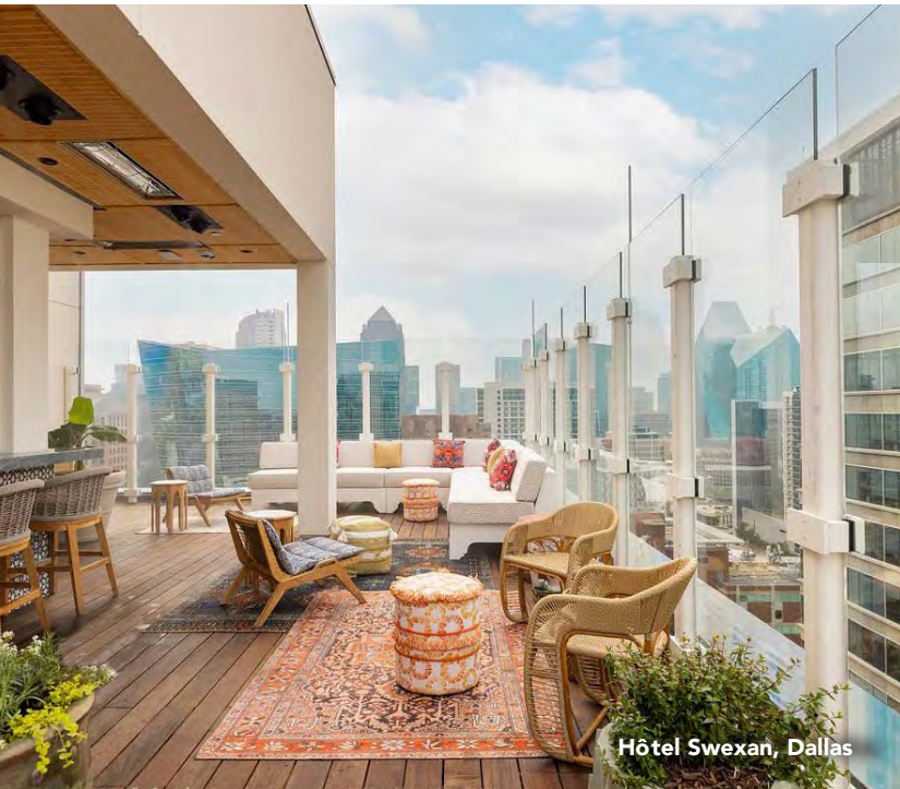
Hôtel Swexan, Dallas

This luxurious Houston hideaway welcomes you with Texas hospitality elevated to a new level. The rooftop pool, fitness center, and full-service spa create a peaceful retreat, while the restaurant prepares local Texas specialties.