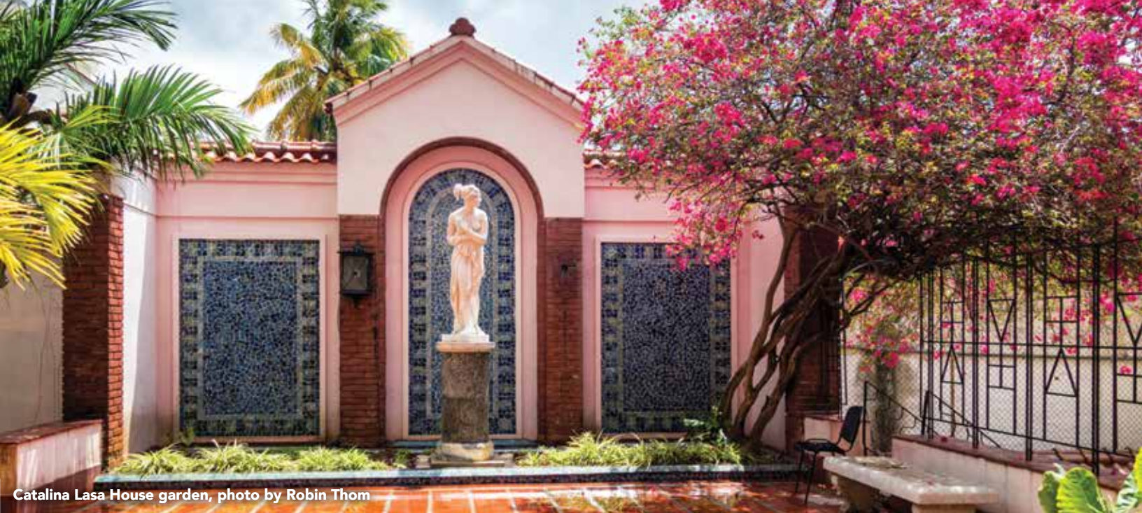
Catalina Lasa House garden