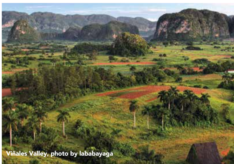
Viñales Valley

On a tour of Havana's architecture view Art Deco to mid-20th-century buildings, including the Bacardi Building (1930), a masterpiece of the Art Deco style. See the highlights of architectural achievements before and after the Revolution, with stops at the López Serrano Building (1932), the Catalina Lasa House (1927) with its interiors by Rene Lalique, and the amazing mid-century Riviera Hotel (1957), a true timepiece of the international style and largely unchanged. In the early afternoon, additional visits to artists' studios are planned. Dinner is at one of Havana's finest paladares . Optional New Year's Eve entertainment can be arranged at a number of the city's well-known music venues, including the famous Tropicana. B,D