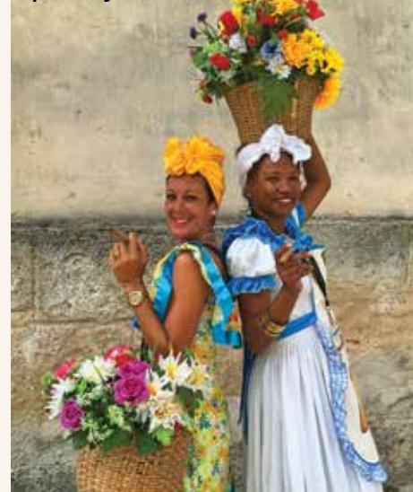
women in traditional costumes, Havana, photo by Isabelle Chauve

EXPERIENCE Cuba's warm hospitality and traditional cuisine when dining at some of Havana's finest paladares