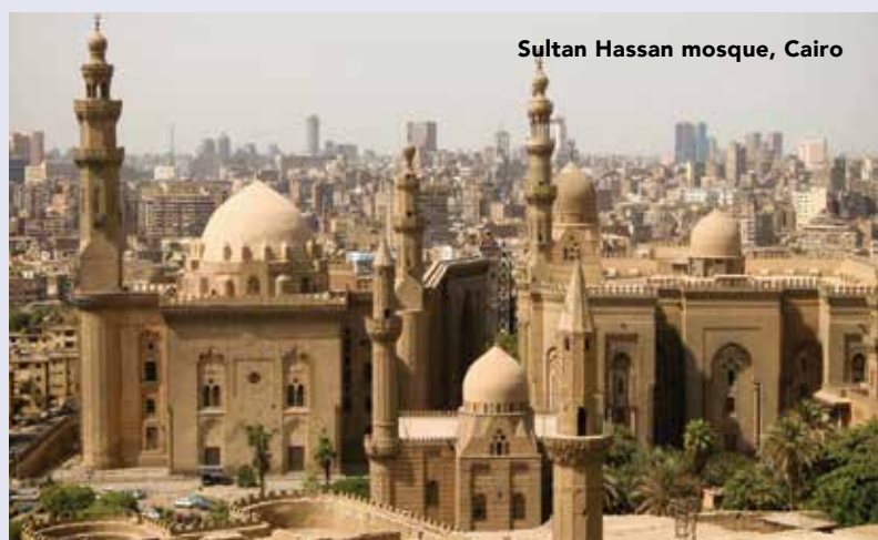
Sultan Hassan mosque, Cairo

This proposed itinerary is subject to change at the discretion of Arrangements Abroad. For complete details, please carefully read the terms and conditions at www.arrangementsabroad.com/terms