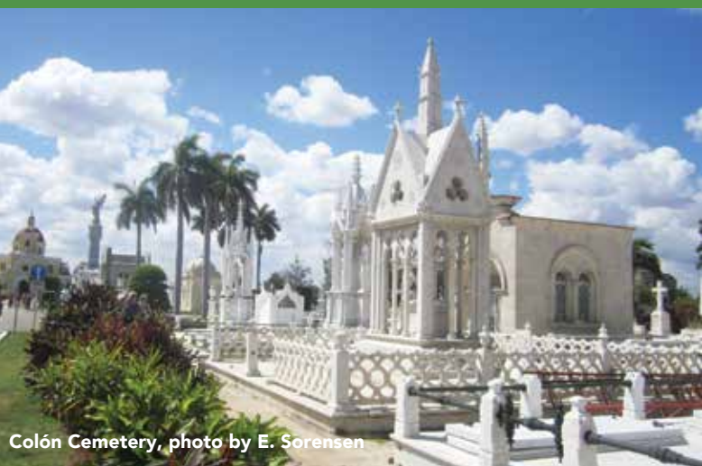
Colón Cemetery, photo by E. Sorensen