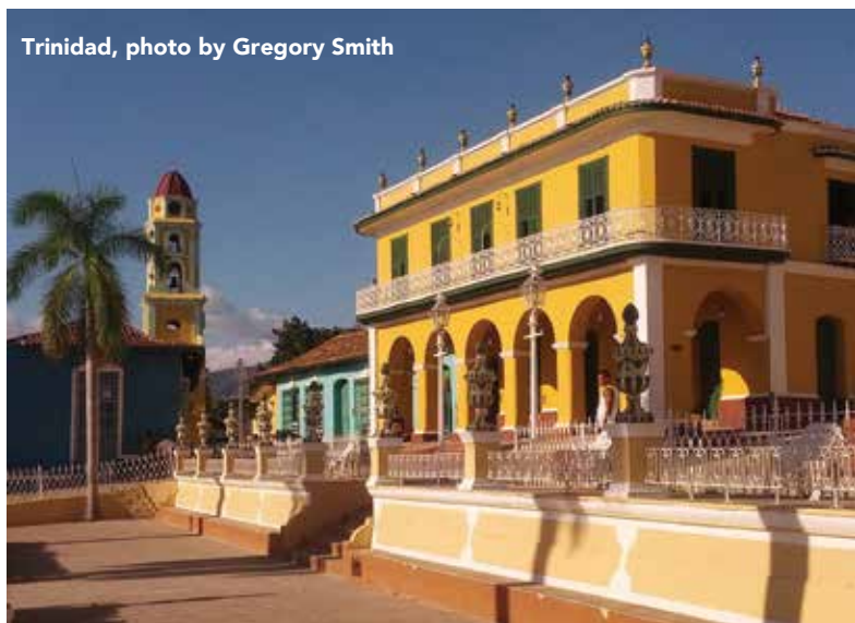
Trinidad, photo by Gregory Smith

Step ashore on remote Isla de la Juventud, at turns a pirates’ hideout (and the inspiration for both Neverland and Treasure Island ), penal colony, expatriates’ enclave, and experiment in communist education. At the now-shuttered Presidio Modelo, a “model prison” of panopticon design, we will visit the section where Fidel Castro was held, now a museum. Following lunch, visit an art school and a local maternity ward, pending scheduling. B,L,D